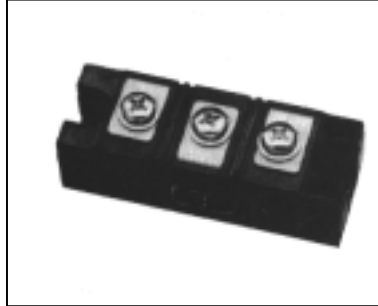
QR_3310001 Fast Recovery Diode Module 100 Amperes / 3300 Volts